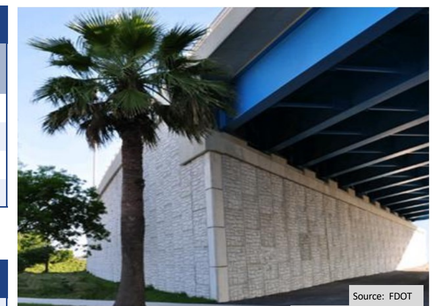
Example of Mechanically Stabilized Earth (MSE) Wall

Estimated Project Cost Total $154,625,200